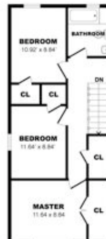
UPPER LEVEL 477sqft