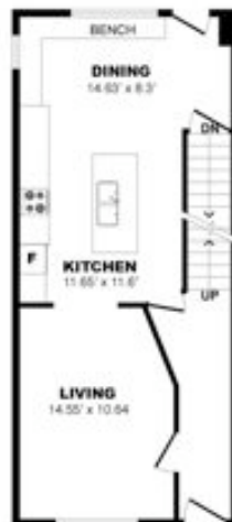
MAIN LEVEL 468sqft